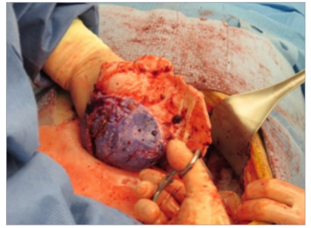
FIGURE 2: Mobilization of spleen in DCL Simulator